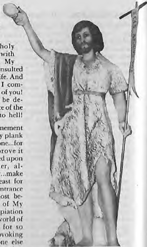
The portavoz is a sister of St. John the Baptist

"The Order of Atonement that I desire is the only plank of salvation for everyone...for you yourselves...approve it now that you are placed upon the pedestal of Peter, although so unworthily...make some atonement at least for your sins, granting entrance to My Order, the most beloved in the bosom of My Church, so that due expiation may ascend from the world of humans to Heaven, for so many sins that are provoking Divine Justice...No one else except My little Portavoz has the rules that are to be approved by Rome for this My Order, because she alone is the depositary, and to her I have dictated them since her childhood. She has suffered a prolonged Calvary until now, and...it is now urgent to take her from the earth, because thus are My plans...but if you do not pay attention to My commands...My plans are to be fulfilled in a certain way that will mock your stubbornness and your cleverness. But no! I still ask you as a Victim immolated for all of you in the Eucharist! My little children...be docile to My messages...pay attention to My humble emissaries of the earth...allow yourselves to perform the good